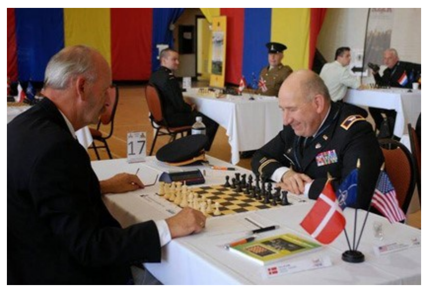
Combining two main parts of my life: chess and Army